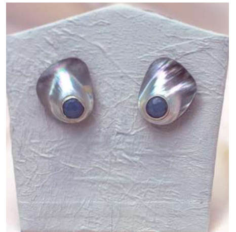
N9: Nehenehe -Silver 925: $195 -Vermeil 18kt: $225