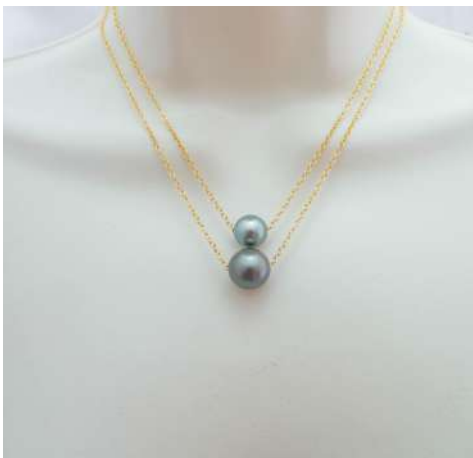
N56: Moehau -Silver 925: $98 -Goldfil 14kt: $135