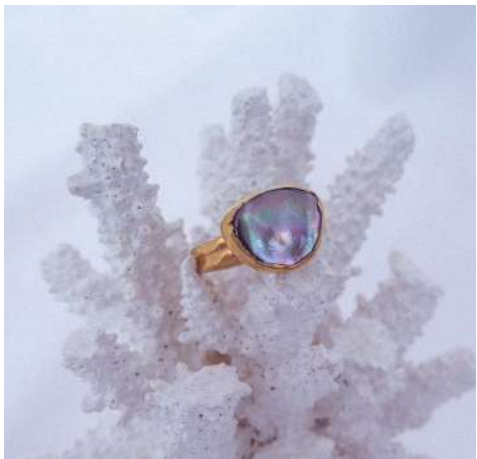
N86: Heiani -Silver 925: $85 -Vermeil 18kt(mix): $89