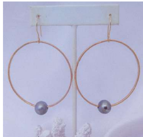
N18: Heipoe -Silver 925: $98 -Goldfil 14kt: $138