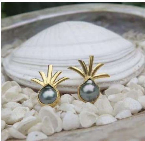
N41: Painapo -Silver 925: $115 -Vermeil 18kt: $128