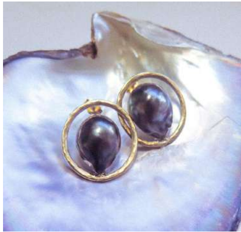
N12: Tipanier -Silver 925: $178 -Goldfil 14kt: $185