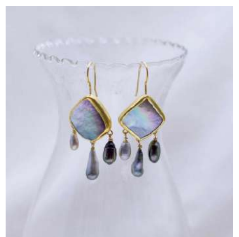
N46: Kanani -Vermeil 18kt: $328