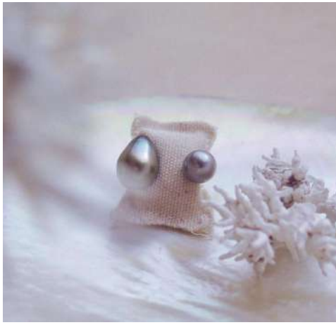
N80: Vaihere -Silver 925: $130 -Goldfil 14kt: $150