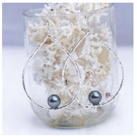
N34: Mohea -Silver 925: $110 -Goldfil 14kt: $155