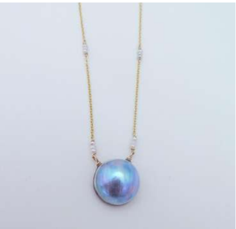
N65: Manihi -Silver 925: $128 -Goldfil 14ktt: $150