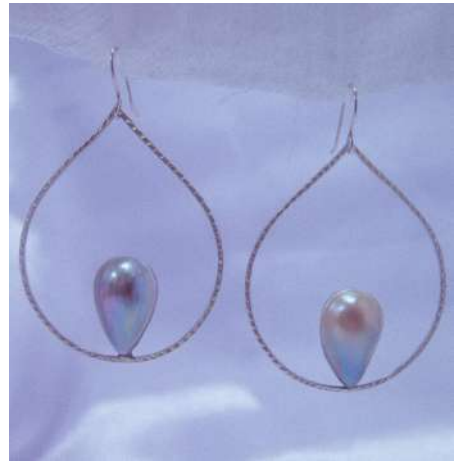
N25: Urarii -Silver 925: $148 -goldfil 14kt: $185