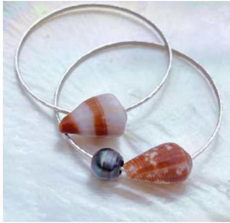
N71: Kalihi(silver 925) -1 shell: $68 -1 Pearl: $78 -1 shell + 1 Pearl: $85