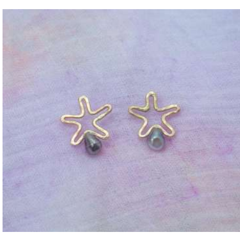
N45: Keali -Silver 925: $70 -Goldfil 14kt: $90