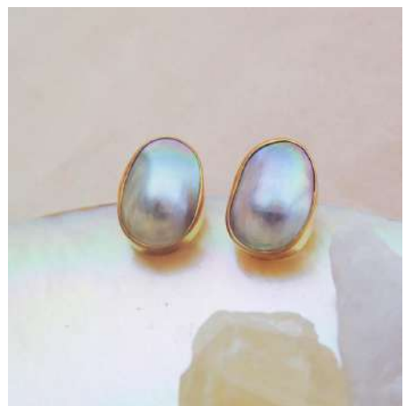
N10c: Mahana (Oval Verm.18kt) -Vermeil 18kt: $245