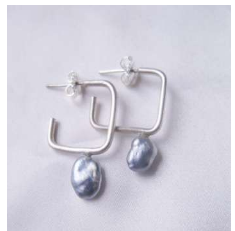
N22: Maire -Silver 925: $58 -Goldfil 14kt: $70