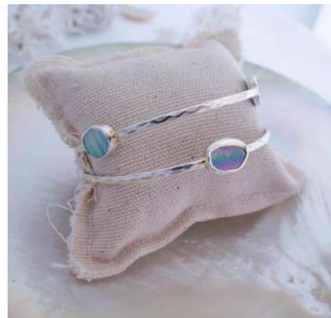
N69: Miti -Silver 925: $92 -Vermeil 18kt: $138