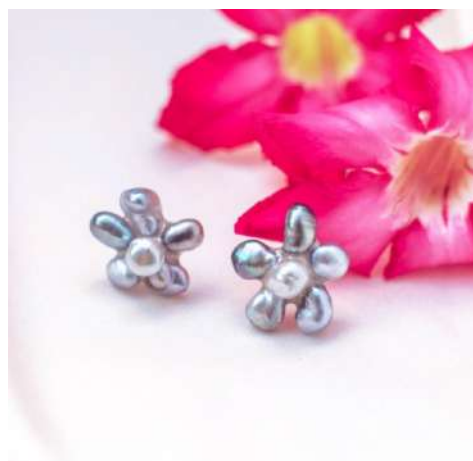
N32: Mokihana -Silver 925 (backing): $105