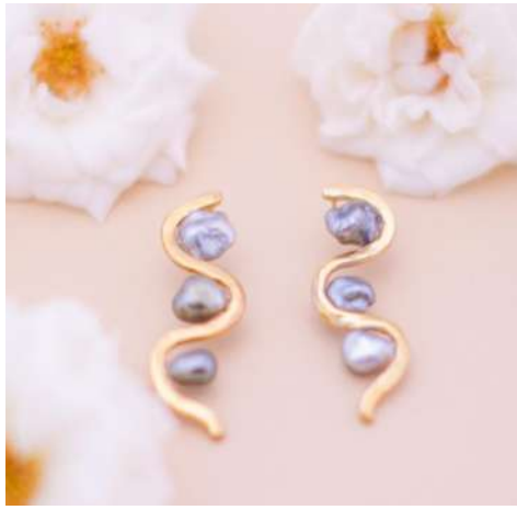
N36: Anani -Silver 925: $120 -Vermeil 18kt: $168