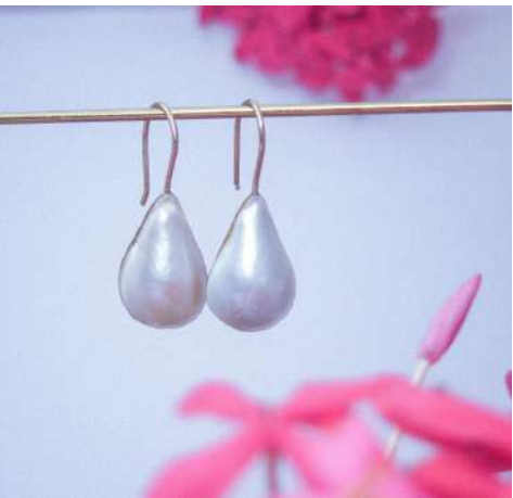
N7: Kirahu -Silver 925: $170 -Goldfil 14kt: $183