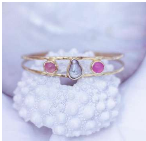
N74: Maile -Silver 925: $158 -Vermeil 18kt: $188