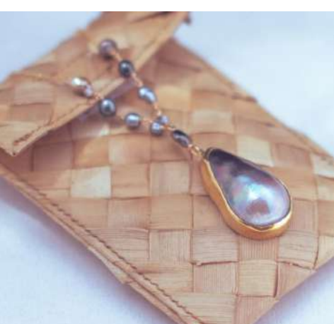
N57: Moetia -Silver 925: $195 -Goldfil 14kt(mix): $245