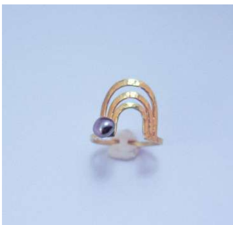
N88: Anuenue -Silver 925: $80 -Goldfil 14kt: $110