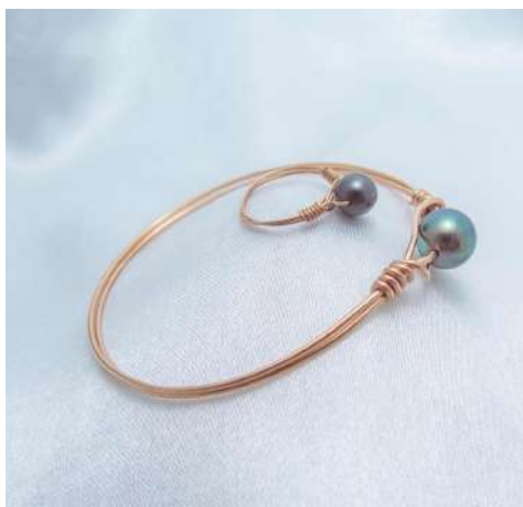
N70: Wai -Silver 925: $78 -Goldfil 14kt: $100