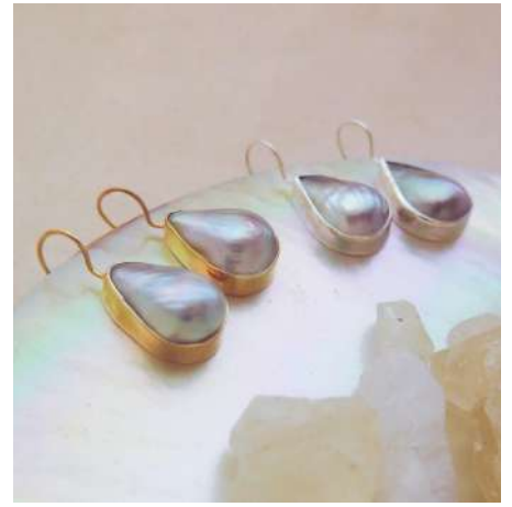
N3: Tehere -Silver 925: $185 -Vermeil 18kt: $248