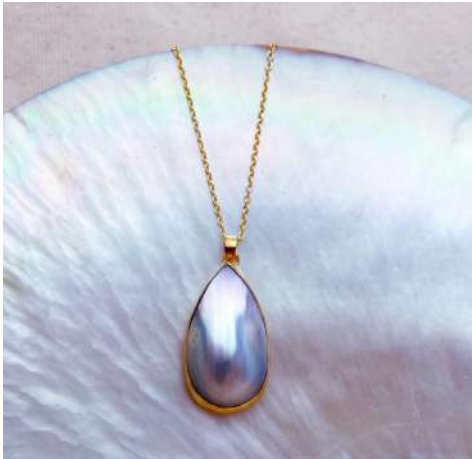
N54: Fare -Silver 925: $178 -Vermeil 18kt(mix): $205