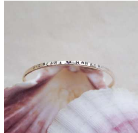
N75: Nalani -Silver 925: $85 -Goldfil 14kt: $100