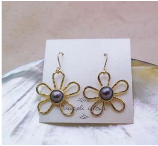
N35: Apetahi -Silver 925: $155 -Vermeil 18kt: $192