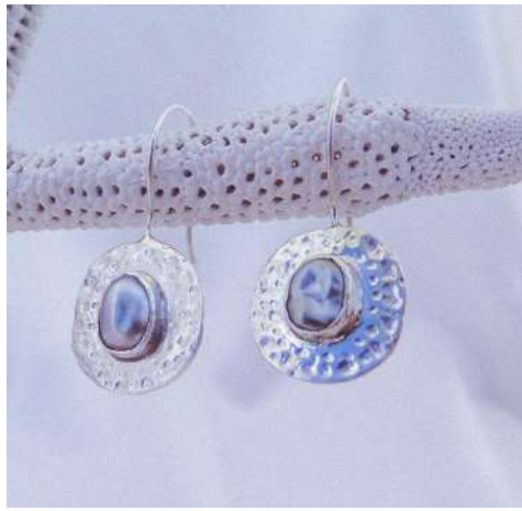
N42: Kalihiwai -Silver 925: $155 -Vermeil 18kt: $178