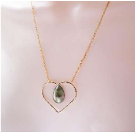
N50: Lani -Silver 925: $138 -Goldfil 14kt: $169