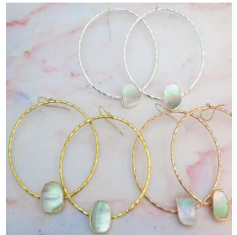
N16: Sapinus -Silver 925: $135 -Vermeil 18kt: $178