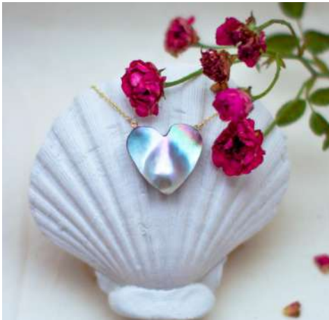
N51: Hinatea -Silver 925: $138 - Goldfil 14kt: $159