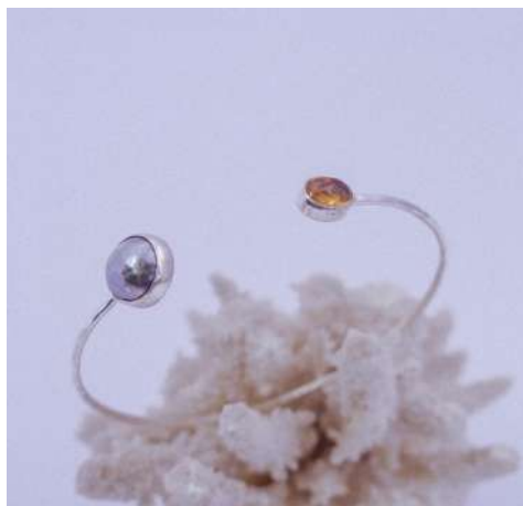
N77: Matahere -Silver 925: $150 -Goldfil 14kt (mix): $180