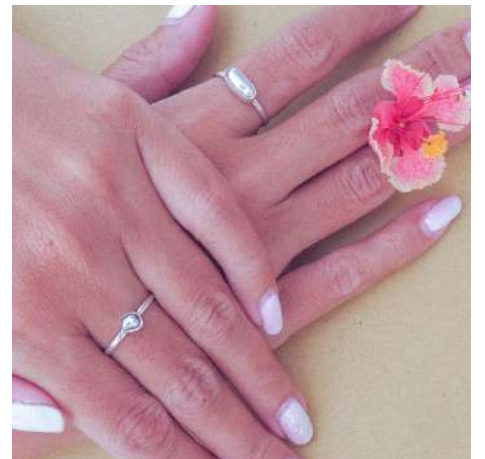
N84: Moerani -Silver 925: $95 -Goldfil 14kt(mix): $109