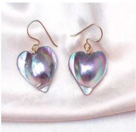
N33: Hanalei --Silver 925: $170 -Goldfil 14kt: $185