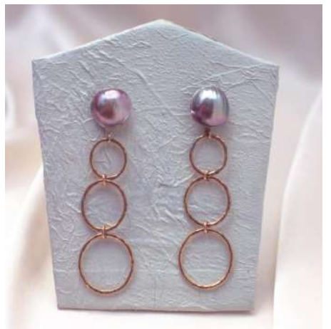
N31: Alizee -Silver 925: $195 -Goldfil 14kt: $218