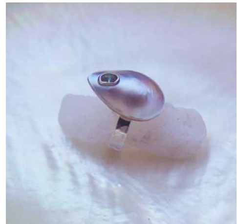
N87: Orihei -Silver 925: $158 -Vermeil 18kt: $180