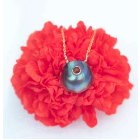
N49: Moku -Silver 925: $168 -Goldfil 14kt(mix): $210