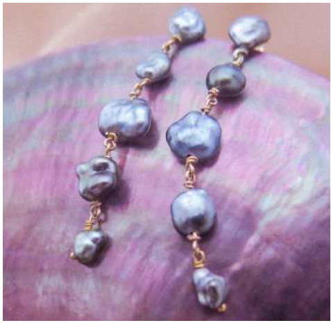
N38: Alohiwai -Silver 925: $138 -Goldfil 14kt: $169