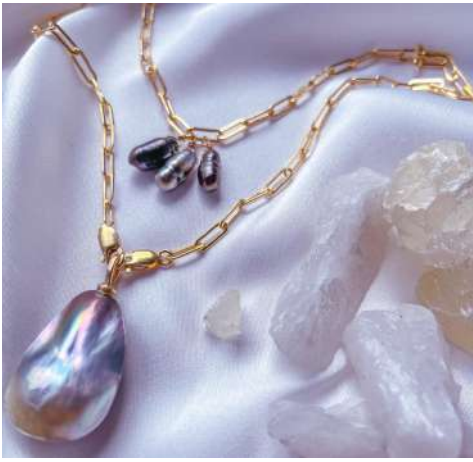
N59: Uvihi -Silver 925: $170 -Goldfil 14kt: $210