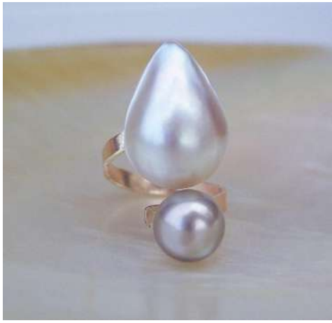
N79: Fetia -Silver 925: $135 -Goldfil 14kt: $155