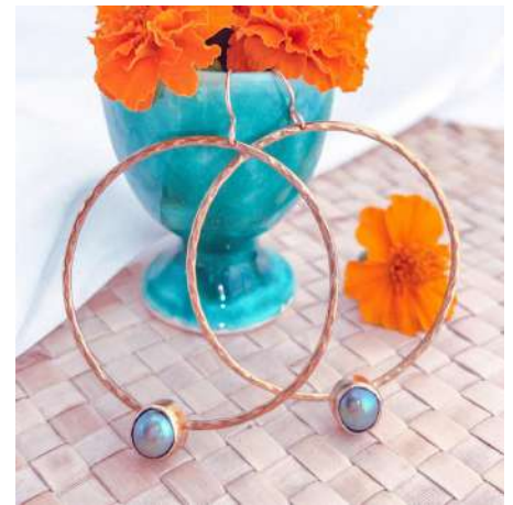
N19: Olena -Silver 925: $110 -Vermeil 18kt: $150