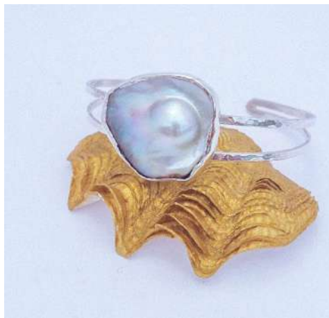
N68: Tiputa -Silver 925: $198 -Vermeil 18kt: $235