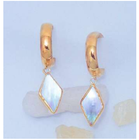
N37: Hana -Silver 925: $168 -Vermeil 18kt: $210