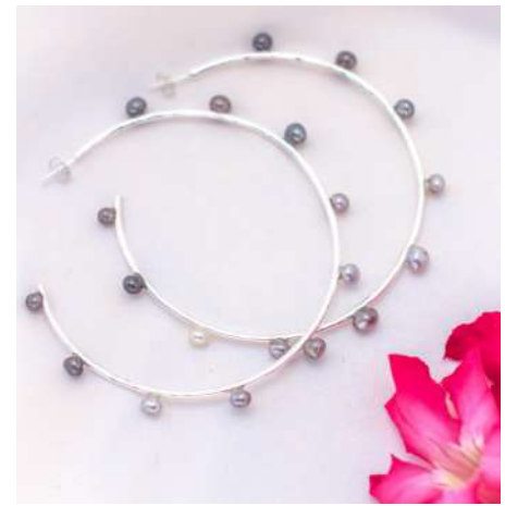
N28: Kiva -Silver 925: $150 Goldfil 14kt: $198