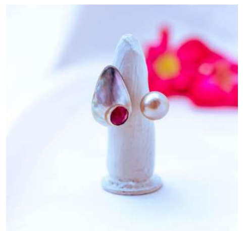
N90: Alana -Vermeil 18kt: $225