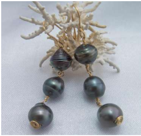
N39: Kiani -Silver 925: $138 - Goldfil 14kt: $169