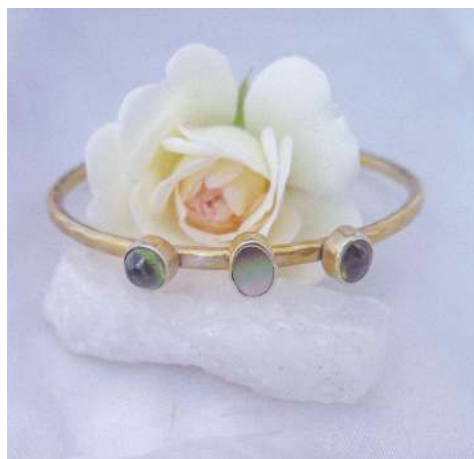
N73: Mehotea -Silver 925: $128 -Vermeil 18kt (mix): $152