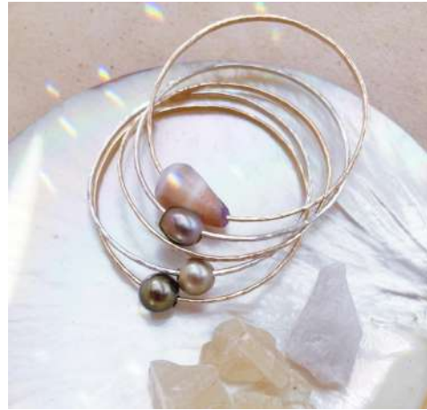
N72: Kihei(Goldfil 14kt) -1 Shell: $90 -1 Pearl: $100 -1 Shell + 1 Pearl: $108