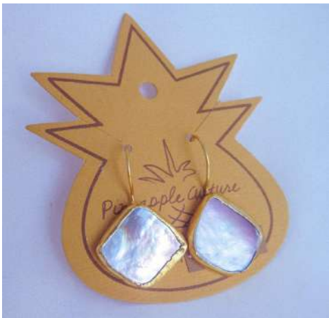
N14: Opuhi -Silver 925: $92 -Vermeil 14kt: $105