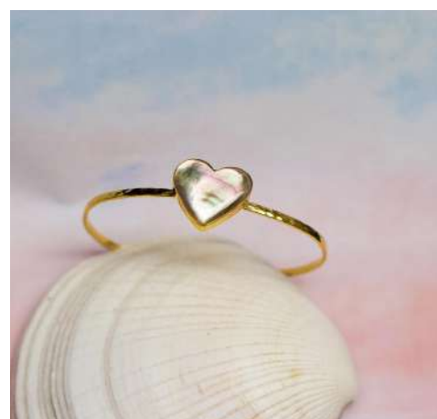
N78: Niue -Silver 925: $118 -Goldfil 14kt (mix): $148