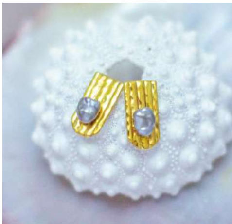
N30: Tetaha -Silver 925: $115 -Vermeil 18kt: $142