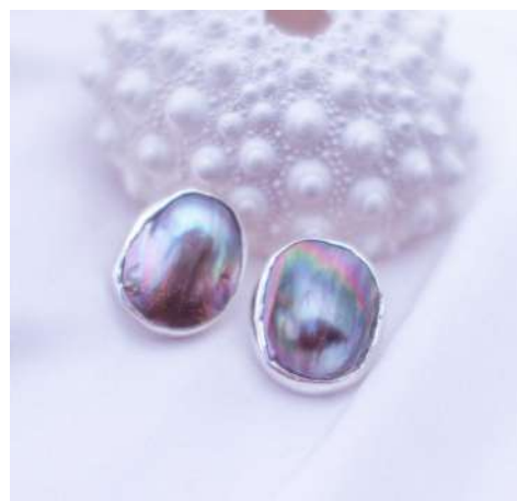
N10b: Mahana (Oval 925 Silver) -Silver 925: $215