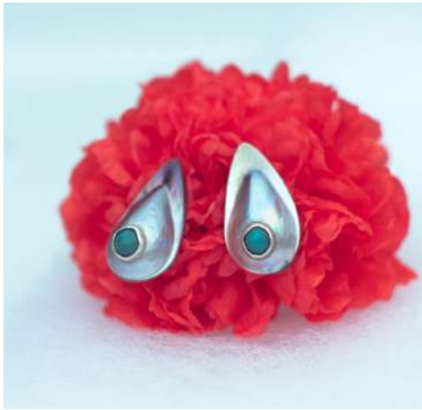
N11: Hinano -Silver 925: $185 -Vermeil 18kt: $215