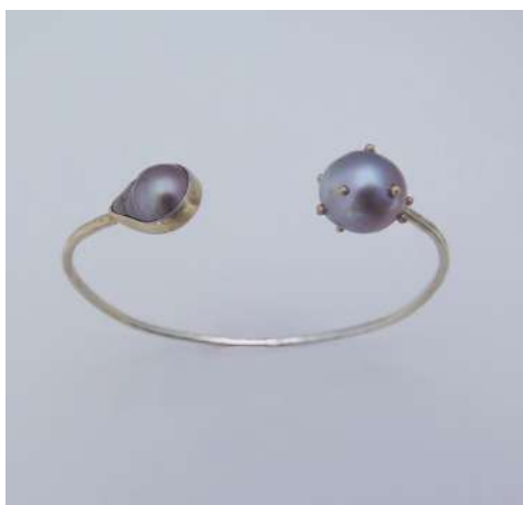
N76: Hakavai -Silver 925: $150 -Vermeil 18kt (mix): $180