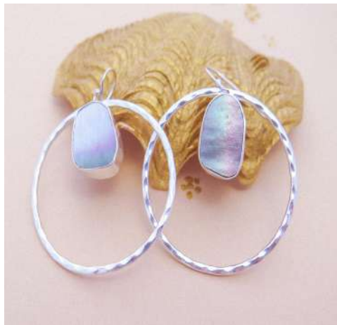
N15: Taapuna -Silver 925: $128 - Vermeil 18kt: $165