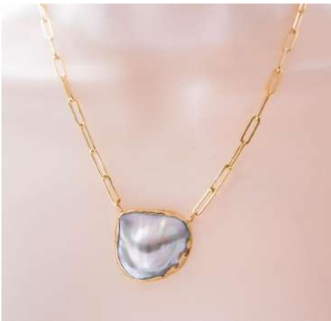
N62: Revalani -Silver 925: $265 -Goldfil 14kt: $298