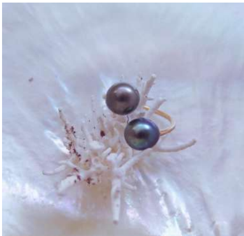
N85: Tehani -Silver 925: $80 -Goldfil 14kt: $98