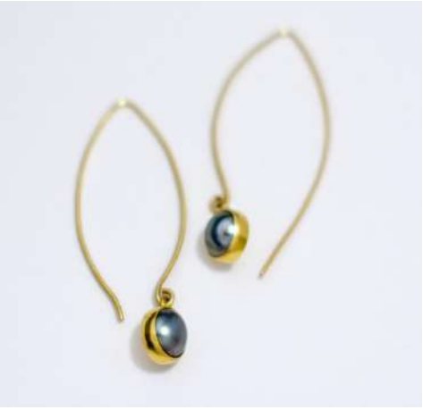
N4: Aute -Silver 925: $128 -Vermeil 18kt (mix): $178