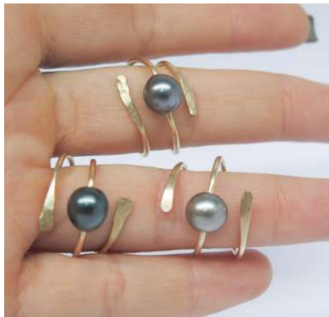
N82: Mareva -Silver 925: $89 -Goldfil 14kt: $98