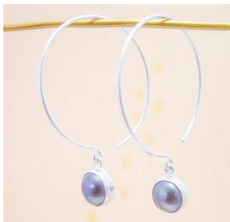
N20: Hina -Silver 925: $78 -Vermeil 18kt(mix): $89