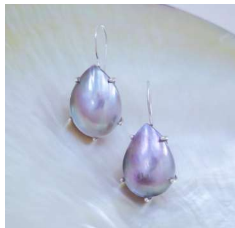
N8: Vahine -Silver 925: $183 -Vermeil 18kt: $210