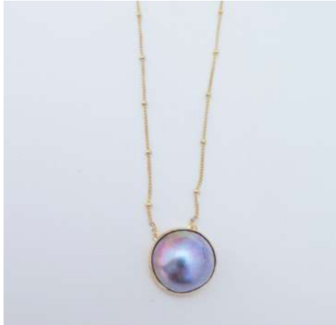
N66: Kaukura -Silver 925: $195 -Vermeil 18kt: $230