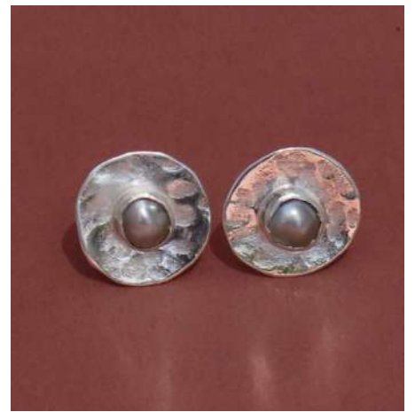
N43: wailea -Silver 925: $158 -Vermeil 18kt: $180