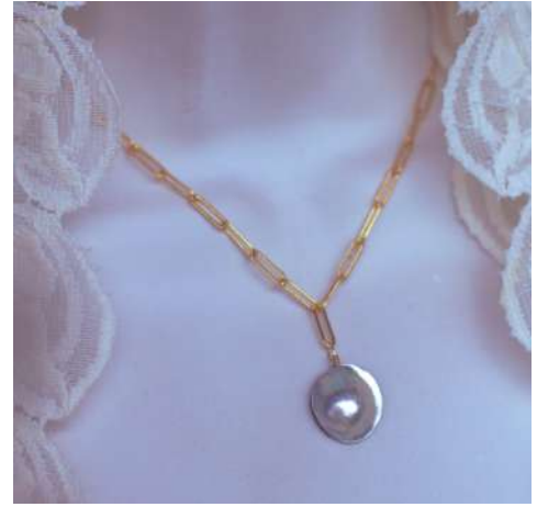
N61: Kea -Silver 925: $168 -Goldfil 14kt: $190