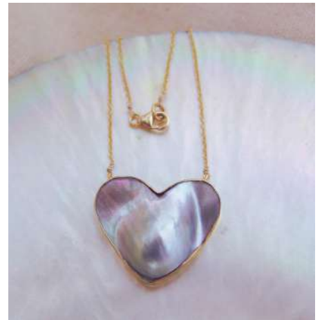
N52: Hitirere -Silver 925: $185 -Goldfil 14kt(mix): $225