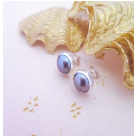
N13: Mahina -Silver 925: $80 -Vermeil 18kt: $100