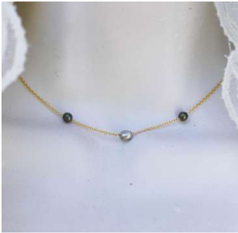
N47: Mehiti -Silver 925: $58 -Goldfil 14kt: $73