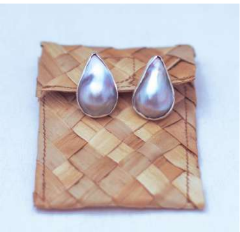
N10a: Mahana (Teardrop) -Silver 925: $215 -Vermeil 18kt: $245