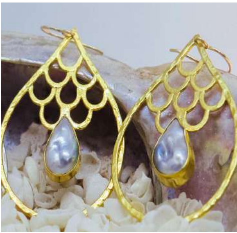
N26: Meherio -Silver 925: $268 -Vermeil 18kt: $285