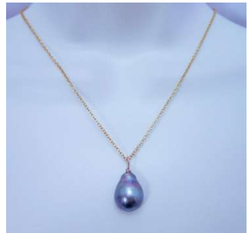
N55: Matareva -Silver 925: $80 -Goldfil 14kt: $115