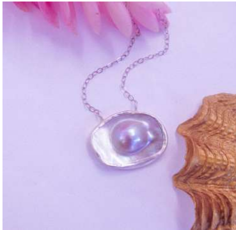
N63: Reatu -Silver 925: $193 - Goldfil 14kt: $215