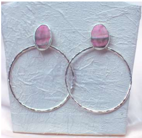
N17: Taharuu -Silver 925: $135 -Vermeil 18kt: $178