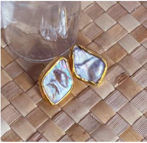
N1: Jambolana -Silver 925: $185 -Vermeil 18kt: $238