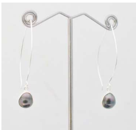
N21: Hereiti -Silver 925: $78 -Vermeil 18kt(mix): $89