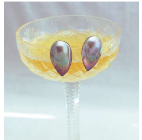
N6: pilikai -Silver 925(backing): $160