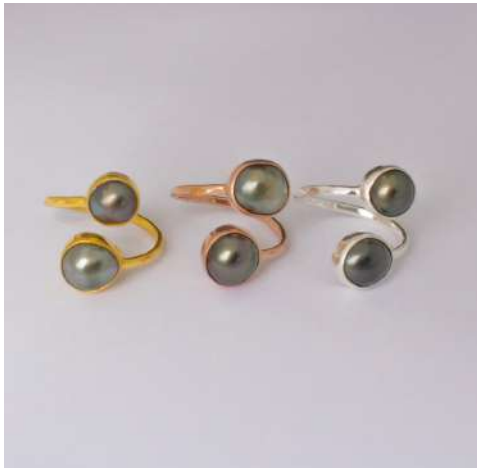
N83: Vaea -Silver 925: $98 - Goldfil 14kt(mix): $115