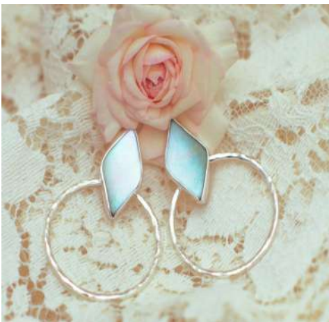
N29: Tihei -Silver 925: $135 -Vermeil 18kt: $178