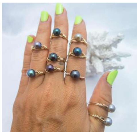
N89: Ailani -Silver 925: $70 -Goldfil 14kt: $89