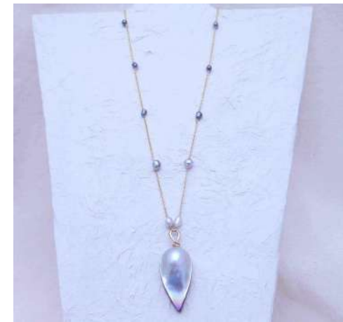
N66b: Maupiti -Silver 925: $168 -Goldfil 14kt: $195