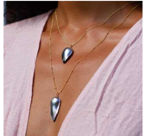
N64: Temiti -Silver 925: $109 -Goldfil 14kt: $145