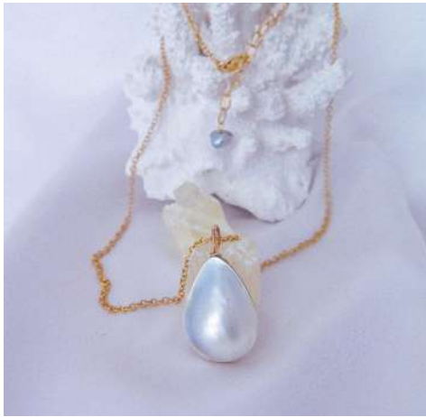
N48: Moemoea -Silver 925: $120 -Goldfil 14kt: $150