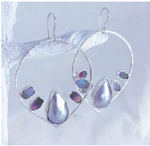
N27: Reva -Silver 925: $280 -Vermeil 18kt: $338