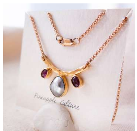
N58: Lava -Silver 925: $163 -Vermeil 18kt(mix): $198