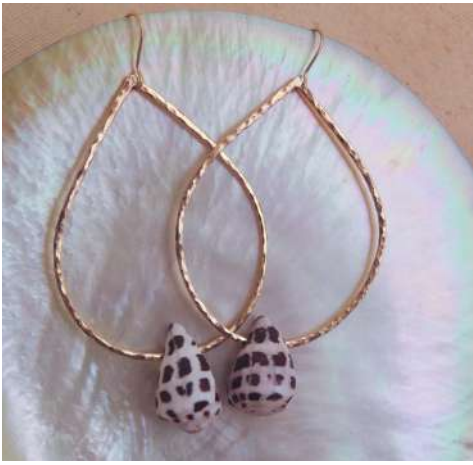
N23: Timeri -Silver 925: $78 -Vermeil 18kt: $110