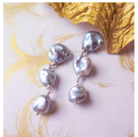
N40: Kilauea -Silver 925: $95 -Goldfil 14kt: $109