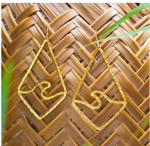
N44: Lahaina -Silver 925: $80 -Vermeil 18kt: $110