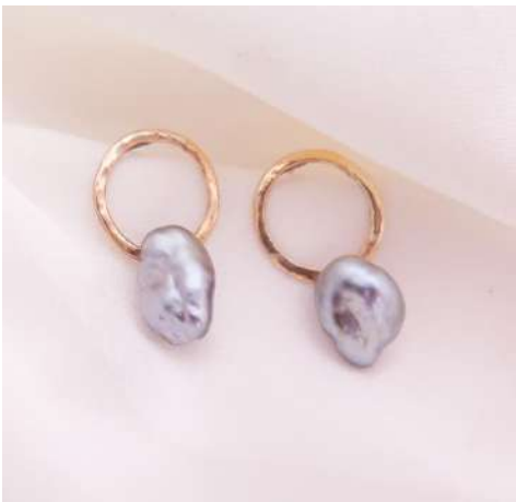
N5: Kahaia -Silver 925: $125 - Goldfil 14kt: $145