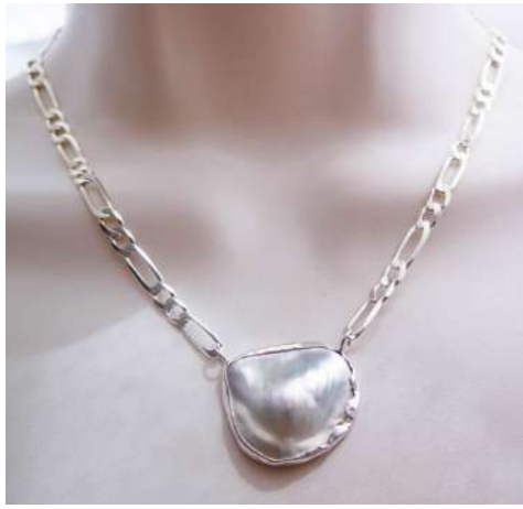
N60: Mauna -Silver 925: $298 -Vermeil 18kt: $310