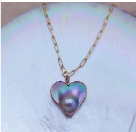
N53: Poevai -Silver 925: $215 -Vermeil 18kt(mix): $289