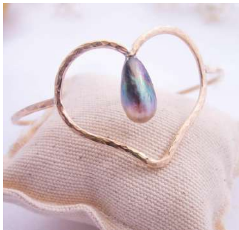
N67: Hereani -Silver 925: $175 -Goldfil 14kt: $208