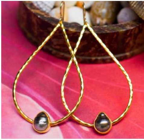
N24: Taina -Silver 925: $110 -Vermeil 18kt: $150