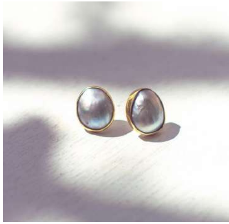
N2: Tiahura -Silver 925: $115 -Vermeil 18kt: $128